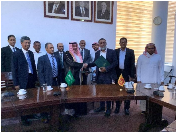
Oceanpick Ltd., South Asia’s inaugural project for oceanic farming based in Trincomalee, Sri Lanka, entered into an agreement to receive import credit from Saudi Export Program of the Saudi Fund for Development on 5 March, at the Ceylon Chamber of Commerce.