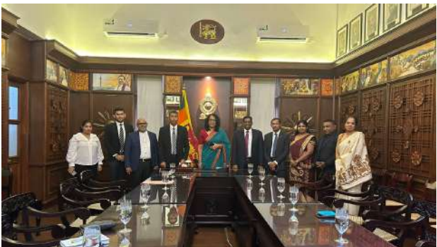
Briefing session between the delegates of Sri Lanka - Canada Business Council with Prime Minister of Sri Lanka, Hon (Dr.) Harini Amarasuriya on 10th of October 2024 prior to leaving to Canada.